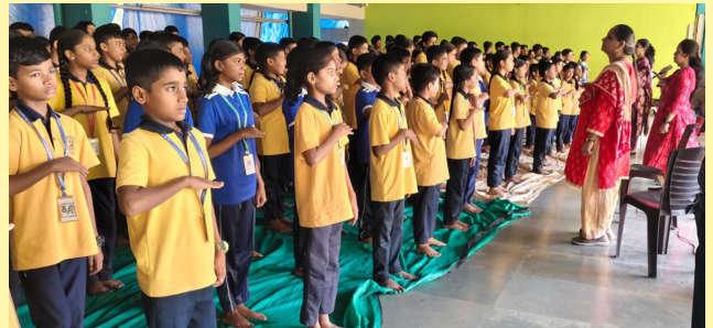
Students of A. B. Goregaonkar School taking an oath saying, "I will not burst firecrackers."

But times have changed. The environmental issue has become very serious. In such a situation, shouldn't we change our traditions to face this change? The culture of firecrackers flourished as money started jingling in the pockets of the middle-class society, and a competitive urge to display wealth began. Despite widespread publicity and communication about the pollution caused by firecrackers, a kind of carelessness, a "why should I care?" attitude, has also spread in society. This recklessness is growing in society.