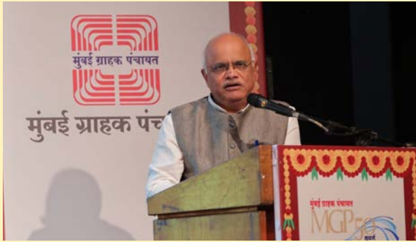
Dr. Vinay Sahastrabuddhe addressing the audience

began on the auspicious occasion of Gudi Padwa on April 12, 1975. This event completed 50 years on Saturday, April 12, 2025, and a grand ceremony was held at Dinanath Natyagriha in Vile Parle to mark the occasion. Former Member of Parliament and Vice President of Rambhau Mhalgi Prabodhini, Dr. Vinay Sahasrabuddhe, was speaking as the chief guest on this occasion.