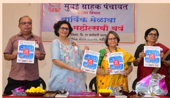
Publication of E-souvenir at the hands of guests