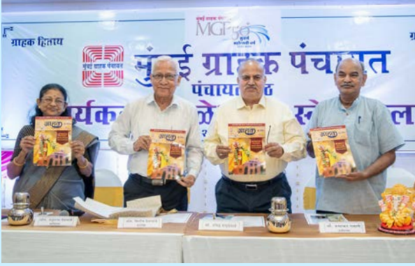
Publication of the Golden Jubilee special edition of our magazine