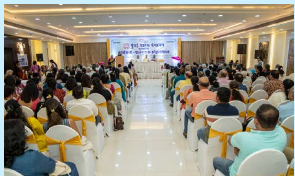
Volunteers and Stall Owners of Mumbai Grahak Panchayat Peth at the get-together.