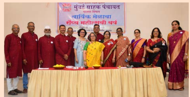
Managing committee members along with guests at Palghar vibhag annual meet