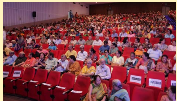
Volunteers at the golden jubilee celebration