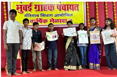
Students of A.B. Goregaonkar School Consumer Club presented the play 'Jahiratincha Bhulbhulaiya'