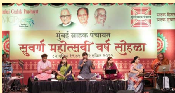
Melodious musical program

and lauded the Mumbai Grahak Panchayat for accomplishing this.